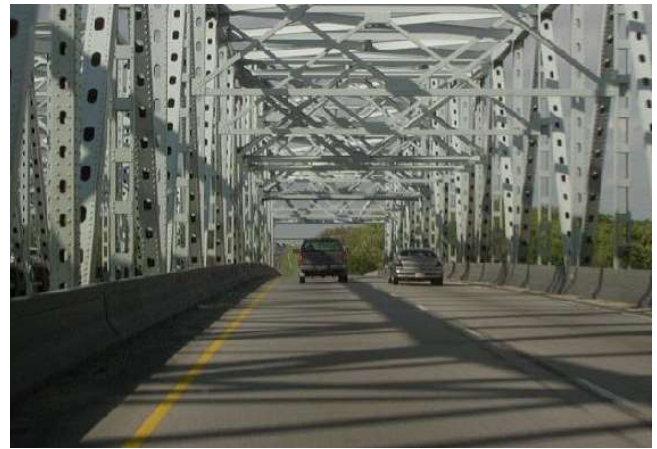
Interstate 55 Bridge Full-Depth Grid Deck

Since the grid deck on this structure is spanning well beyond the allowable fatigue limit, failure due to fatigue cracking would be predicted to occur little more than 3 months after being opened to traffic. This calculated result is obviously much different than the 28+ year satisfactory service life experienced by the grid deck on the Interstate 55 bridge.