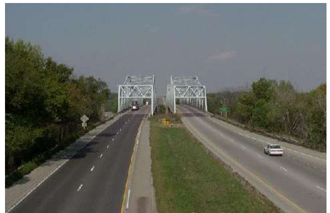
Interstate 55 Bridges, Will County, IL

For example, the bridge on Interstate 55 over the Des Plaines River in Will County, IL is comprised of a flush filled 4-1/4" full-depth deck with an asphalt overlay. The deck was originally installed in 1980 with continuous spans (continued)